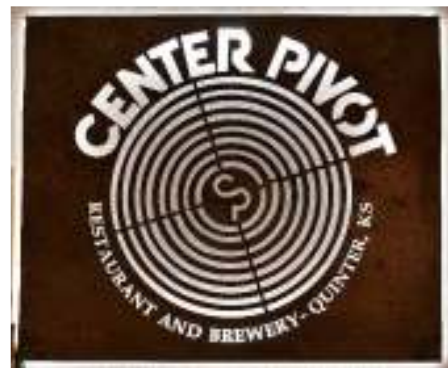
Center Pivot logo, t-shirts & hats.