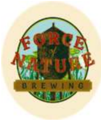
Metro KC breweries continue to expand their reach as Desoto, KS now has a craft brewery. “FORCE OF NATURE” Brewing opened for business in August.