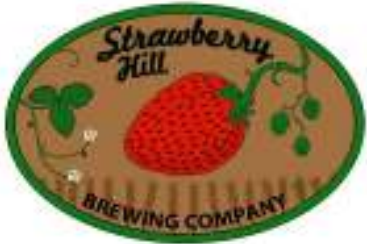
After many years of anticipation, “STRAWBERRY HILL” Brewing Company opened for business in early September.