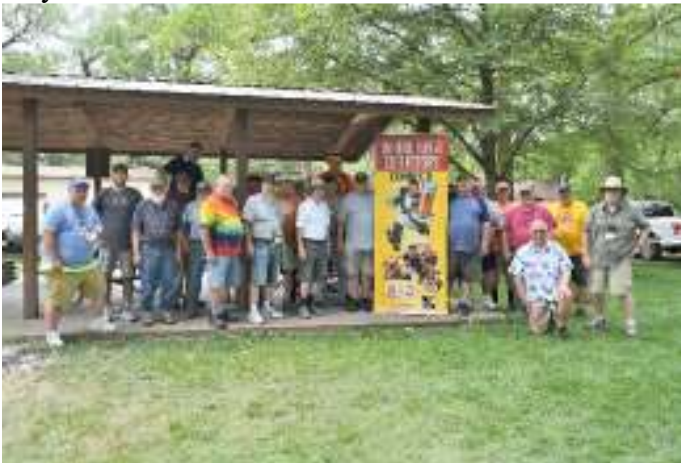
Group photo of some of the show attendees.

As usual, the KKKK show was a fun and enjoyable event.