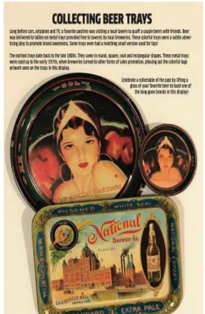
The placard above tells the story of beer trays.