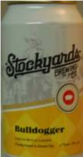
It has been a while since Stockyards Brewing Company canned a new style beer. Bulldogger is a Czech-style lager.