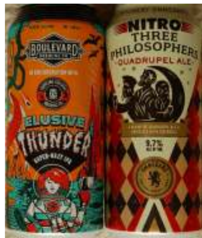
Boulevard Brewing came out with two interesting 16 oz cans this spring. Elusive Thunder is in the Space Camper series. The Nitro Three Philosophers is unusual in that it shows Ommegang Brewery on the neck of the can but

the side panel shows brewed and canned by Boulevard Brewing. Ommegang is a sister company of Boulevard.