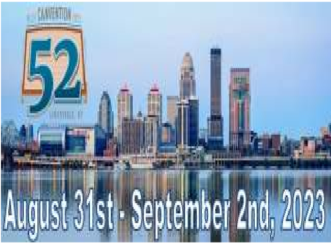
Awesome CANvention in Louisville.