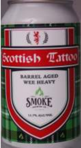
A few late summer releases from Smoke Brewing in 12 oz cans. Above: Fest doesn't show its style and Violet's House is a blueberry lager. Scottish Tattoo is a barrel aged heavy ale.