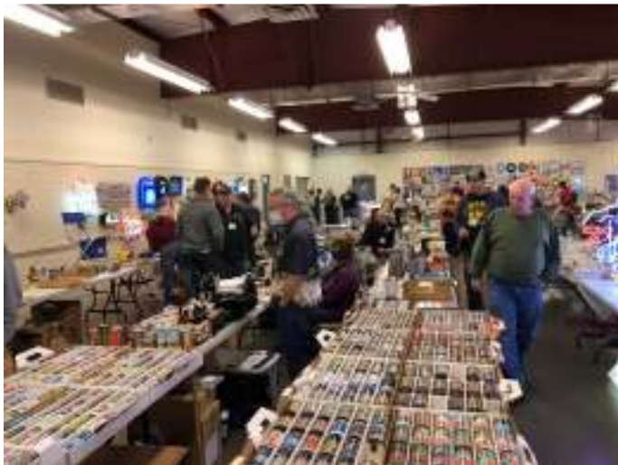
A busy trade floor above.

Final numbers for the 2nd Annual Old West Breweriana Roundup in Hays, KS: 120 tables. Vendors from 11 states and 340 walk-ins!