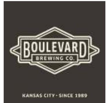
Space Camper IPA came out with CYBERSONIC C-HOPS in 16 oz cans and is a double IPA.