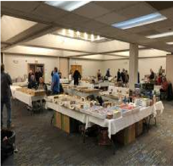
Grand Glaize Conference Room