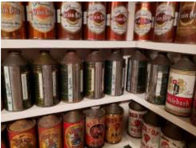
Tony Stice posted these front and side photos of 8 Muehlebach cones from his collection on Facebook.