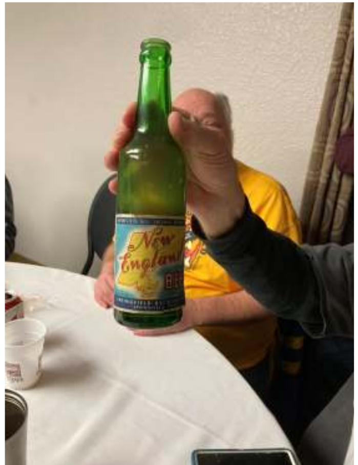
Iron gut challenge