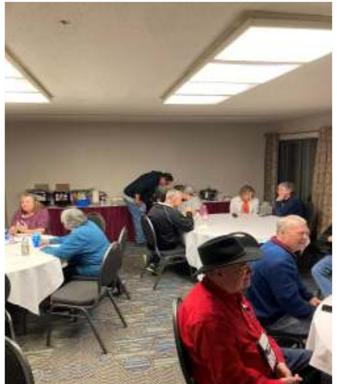
Friday night hospitality room