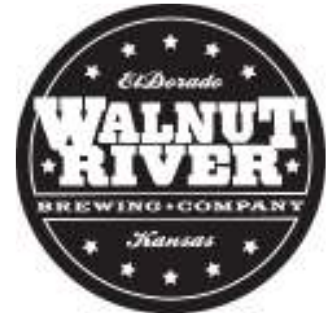
Devil's Blend Coffee Porter from Walnut River Brewing in 12 oz cans