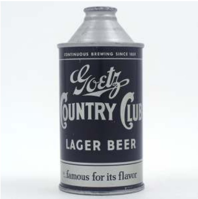
From the Morean Auction

This is the actual can pictured in the USBC. RARE cone, this is THE ONLY example of this can of which we are aware. Outstanding condition! Great looking can with the color-matched silver spout. Factory original finish top the paint. An examination of the inside of the can reveals that this label was printed on the reverse side of what appears to be an unknown or misprinted Tornberg Old German sheet that features a red, white, and blue color scheme! Small number 2 is scratched into the spout. Bottom has been replaced or added and can measures about 1/3 of a rim high. Provenance to the Jeff Smith Collection (one of the top cone top collections ever put together) which was sold to Tony Steffin in the late 1980s. Gorgeous!