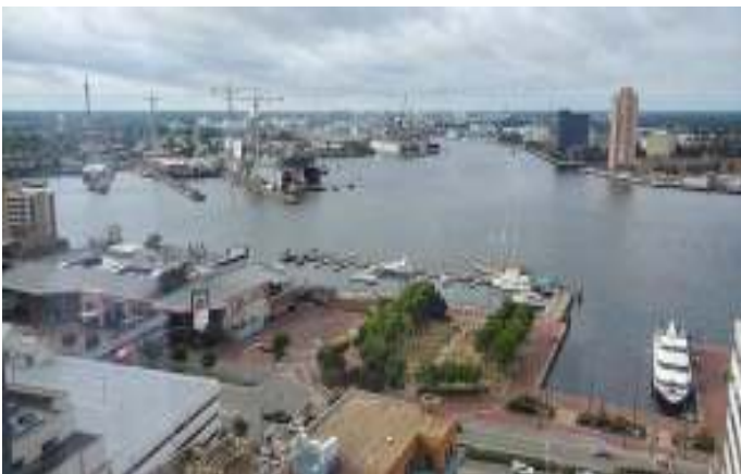
Looking out from a room window at the host hotel