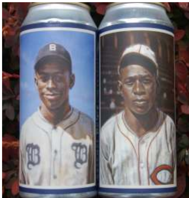
Two of the four Satchel Paige cans are shown above. The cans are 16 oz. The can on the left is Satchel in his Birmingham Black Barons uniform and (right) is in his Cleveland Cubs uniform

This first release celebrates Satchel Paige, and the 50th Anniversary of his Hall of Fame election. It includes four classic Kreindler paintings of Paige from his time on four different teams from the 20s to the 40s. As for the beer inside the cans, with the focus being entirely on the Leagues and its' players, we went toward a style that was the predominant beer of the time period. Our American-style Pilsner is made with domestic 2-row barley, a hint of flaked corn, and hopped with domestically grown Contessa to give a light floral aroma and a unique spin on a classic style consumed at every ballpark in the US.