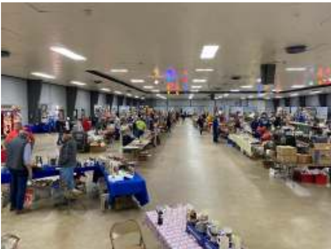
Huge trade floor filled end to end with collectibles