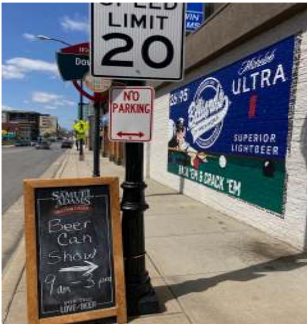
Sign directing collectors to the entrance at Billiards