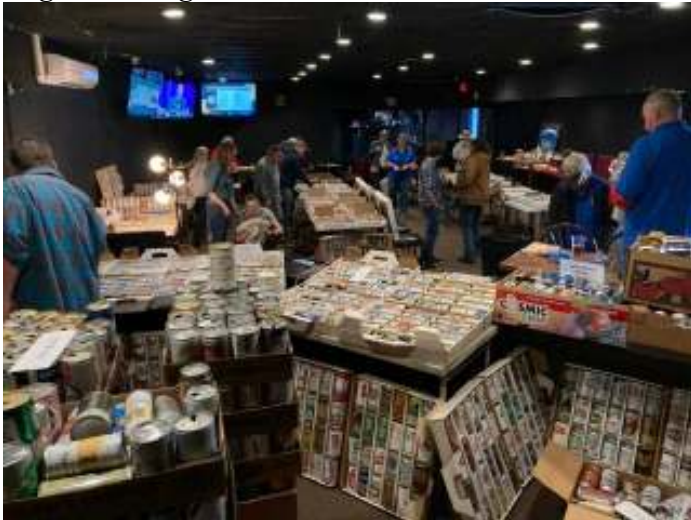
Action on the trade floor above and below