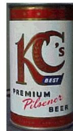
Chapter #22 of the BCCA