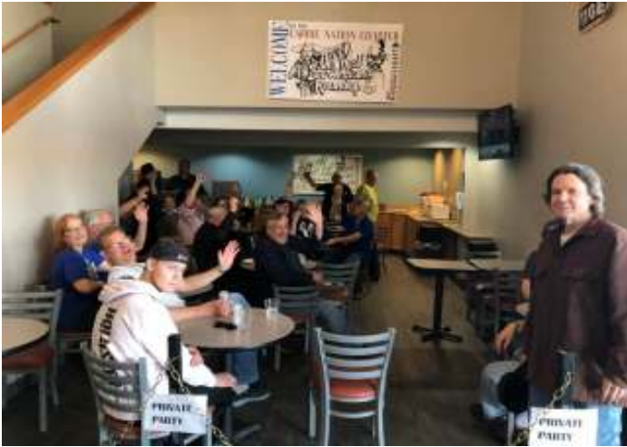
Nice welcome banner for the hospitality suite.