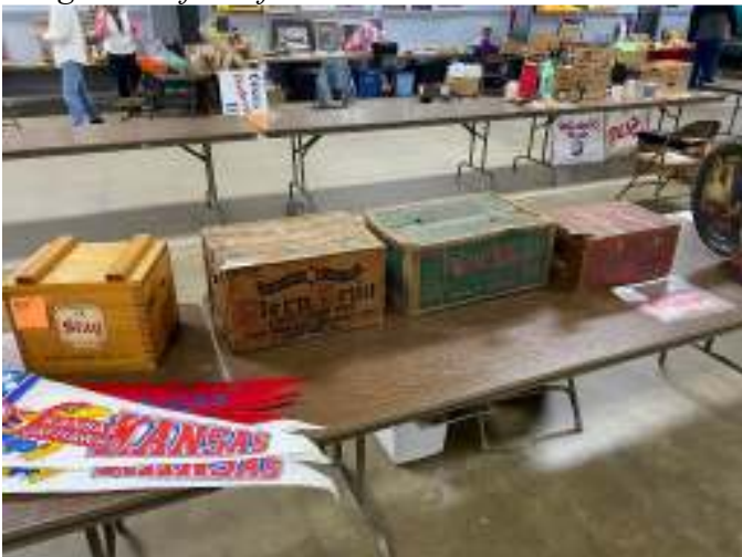
Even a couple of Kansas Jayhawk banners found their way to Illinois