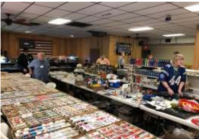
Trade floor was full and walk-ins plentiful as evidenced above and below.