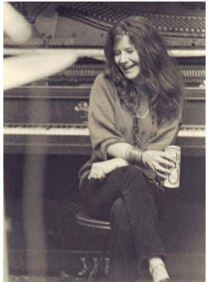
Janis Joplin enjoying a 16 oz can of Colt 45 Malt Liquor

Take another little drink of my beer now baby