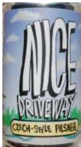
Torn Label Brewing Nice Driveway is a 12 oz Czech-Style Pilsner. Speaking of Torn Label, their new taproom space next to the brewery is a huge improvement over the previous layout.