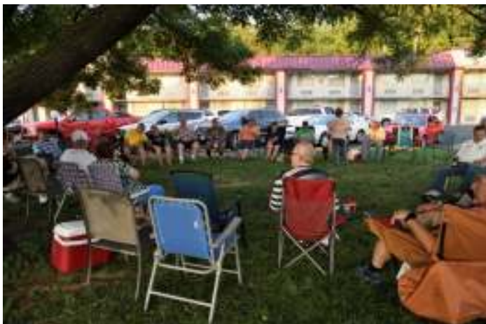
Friday under the Flowering Yellow Hawthorne.

We had over 60 registrations from 12 states (AZ, VA, WI, IN, KY, TX, SD, OK, NE, CO, MO, and KS)