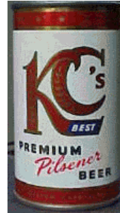
Chapter of the BCCA

Next year's show is planned for June 24-26, 2022.