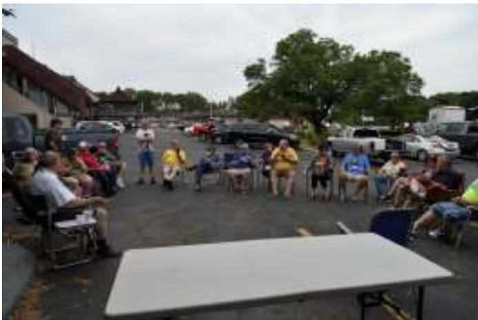
Sunday morning raffle at the host hotel

The Sunday morning raffle is the traditional conclusion of this show and a chance to say see you next year.