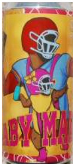
Baby Mahazy is in a 16 oz can from Diametric Brewing and is a pale ale with hibiscus.